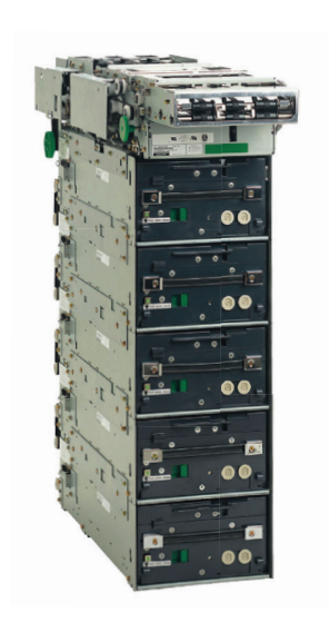
F510 Bill Dispensing Unit