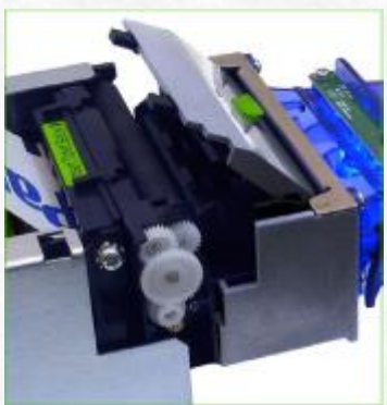
Modular design reduces maintenance